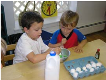
Thank you to everyone who participated in Summer Camp. It was a rich and exciting summer!

“As we open our hearts to children we embrace them with love, acceptance and without judgment”