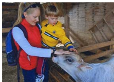
Ashley's class enjoys the beauty of Shelburne Farms